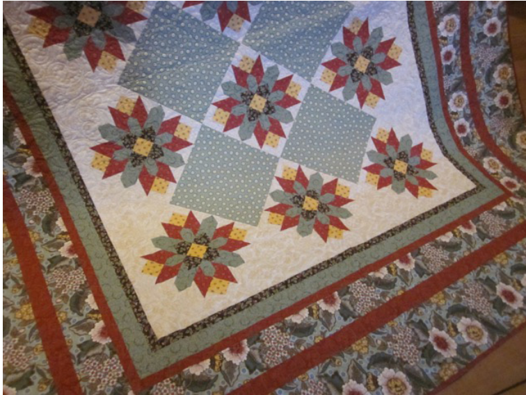
Painted Daisy 86 x 103-inches